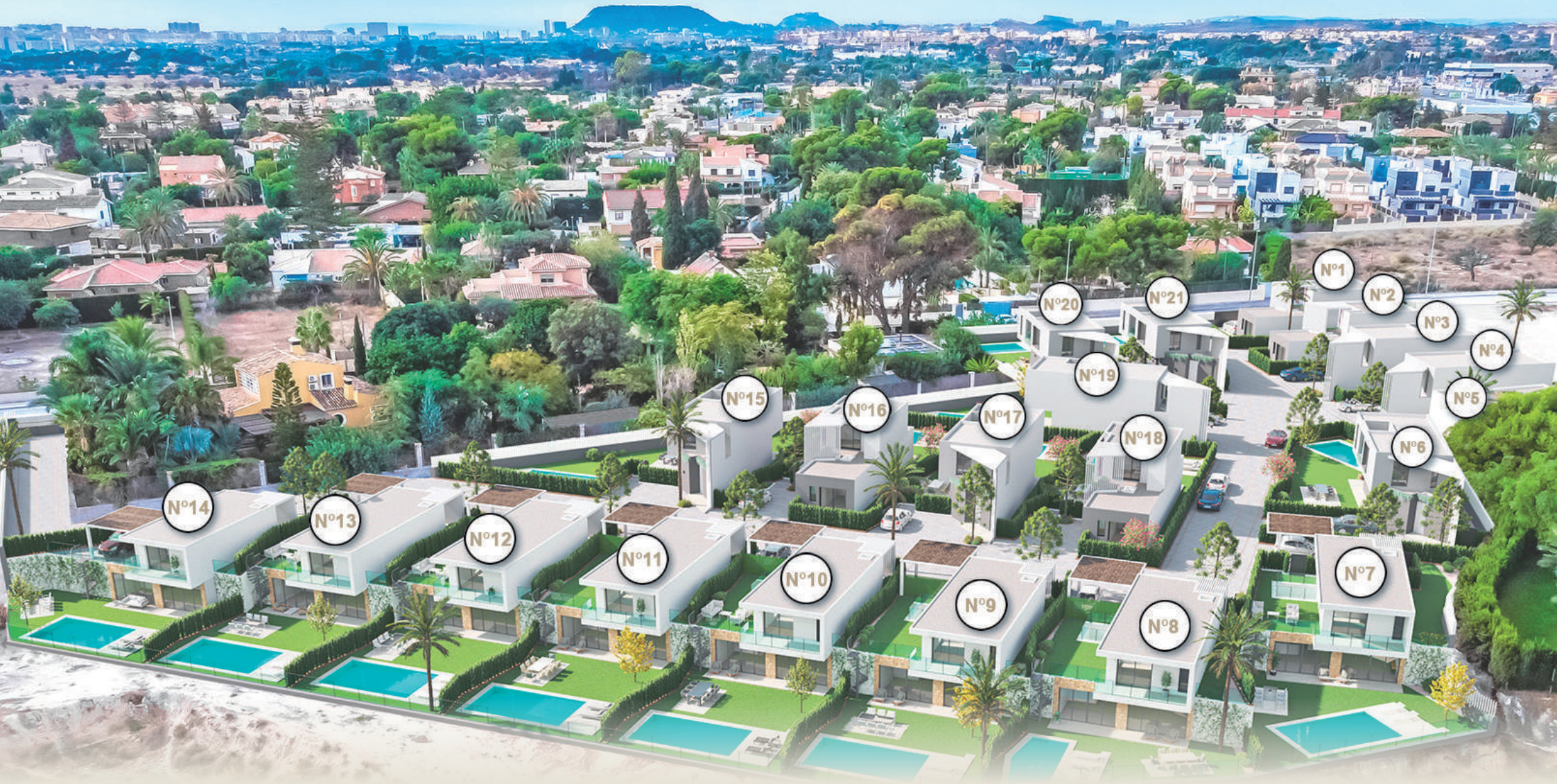
Air view of the urbanization